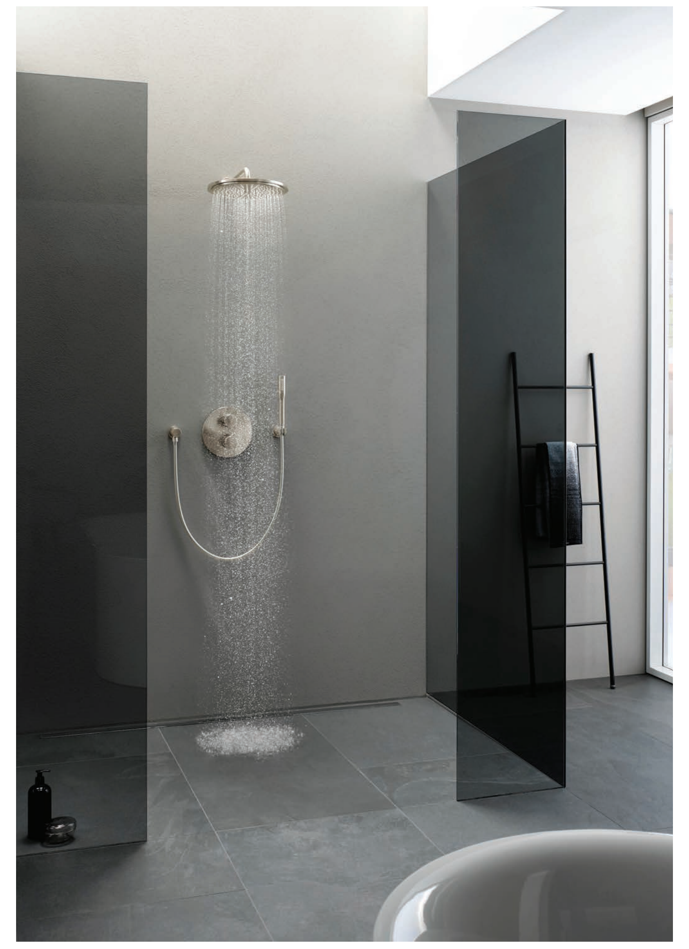
APRIL | KITCHENS BEDROOMS & BATHROOMS 73